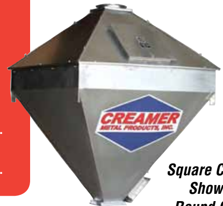
Square Cleaner Showing Round Cones